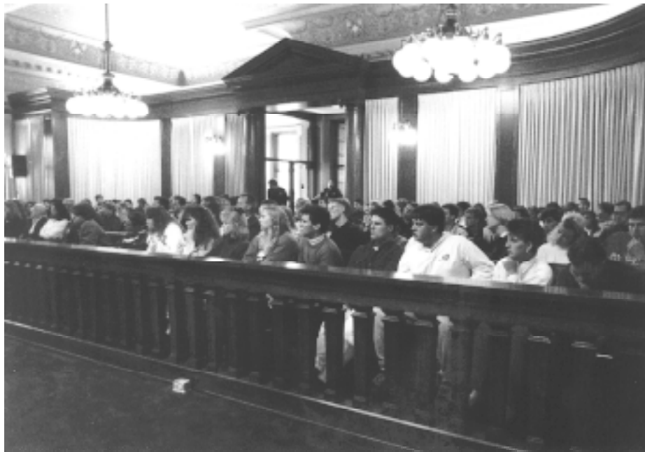
Spectators pack a courtroom in Green Bay, Wis., to hear arguments before the Wisconsin Supreme Court as part of the court’s “Justice on Wheels” program. The court’s principal office is in the state’s capital, Madison.

• Speakers Bureau —The director of state courts has created a speakers bureau to help more than 100 judges around the state share