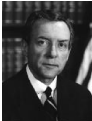
Sen. Orrin G. Hatch (R-Utah), ranking minority member of the Senate Judiciary Committee, discussed federal crime legislation with state and federal judges in Washington in May.